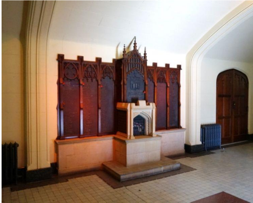
Melbourne Grammar School Honour Roll